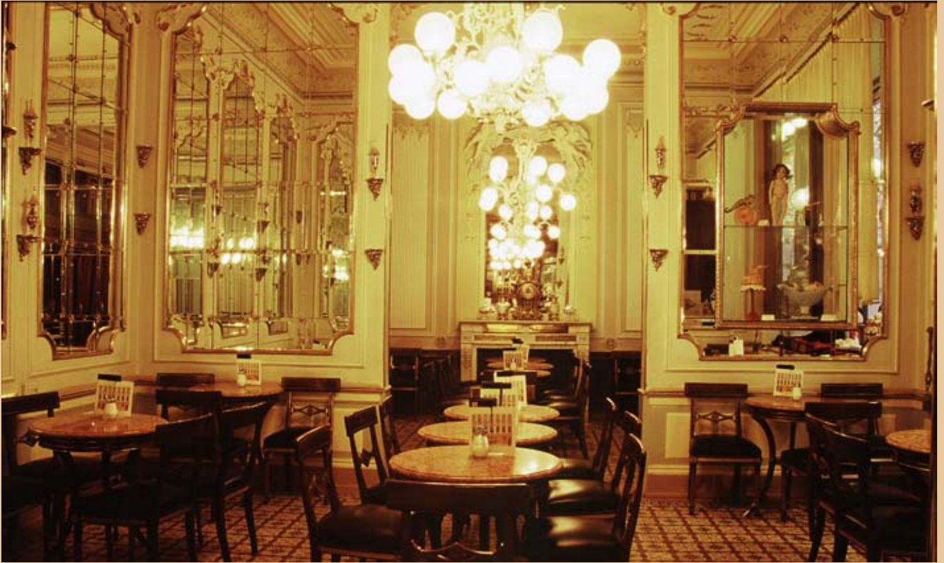
Cafe Demel - Vienna

F or the contracting, transfer and individual adjustment of this complete Viennese Coffee-house know how the following conditions apply: