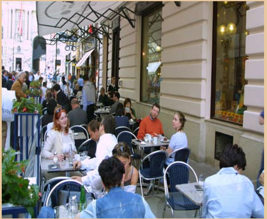
Cafe Demel - Vienna