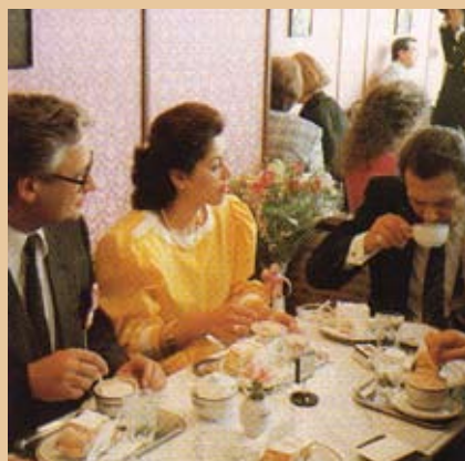
Cafe Wien - Nagoya I