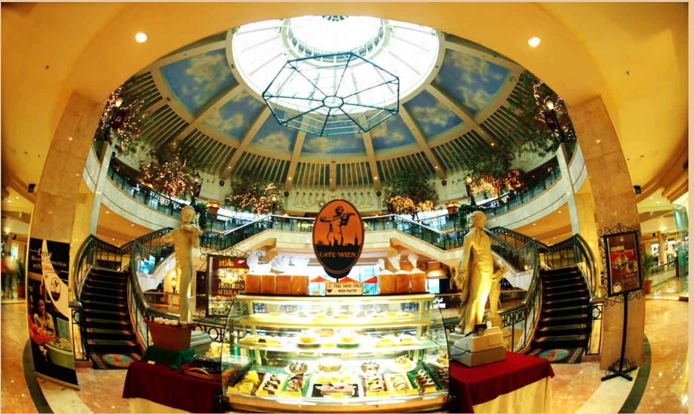
Cafe Wien - Jakarta I

M ay we forward a short list of arguments to you, why you should become a franchisee in our „Cafe Wien“ Franchise System: